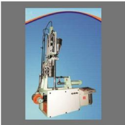
Vertical Screw Type Plastic Moulding Machine