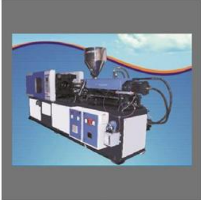
Plastic Injection Moulding Machine