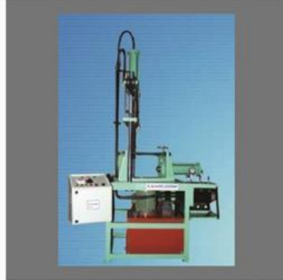
Vertical Injection Moulding Machine