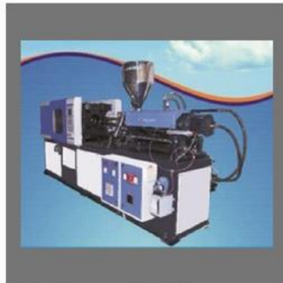
Plastic mug Making Machine